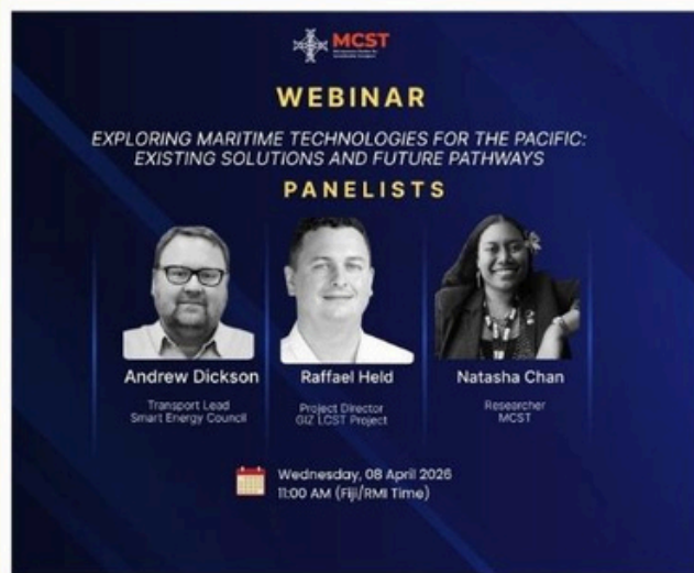
2 WEBINAR 02/2026