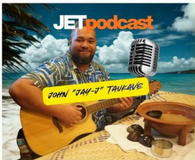
1 JET NEWS PODCAST TALANOA