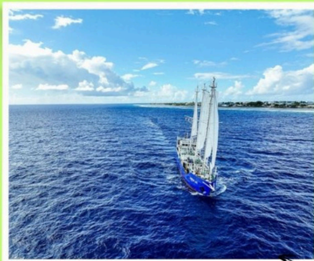
4 PBSP INAUGURAL MINISTERIAL COUNCIL MEETING IN MAJURO, MARSHALL ISLANDS