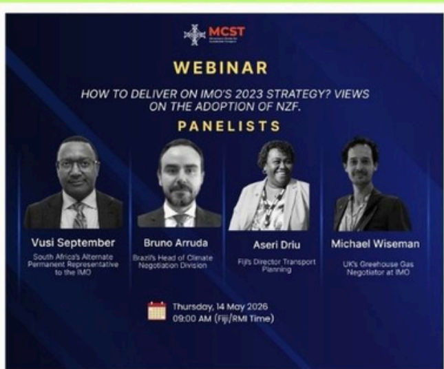
3 WEBINAR 03/2026