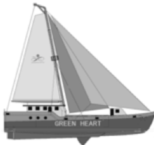
Figure 4: Greenheart Vessel

The intention, assuming funding is secured, is to trial renewable energy shipping technology and operation using different vessel types on up to three selected Fijian routes as part of the six-year research programme, with the trials progressing from forward planning, to controlled field research and ultimate transfer to community managers/owners. Two types of vessel design are anticipated as the initial focus: village-scale catamarans of between 4 and 10 dwt load-carrying capacity and small freighters capable of carrying between 60 and 100 tonne payloads. Both vessel types were identified as being the most appropriate in previous research during the 1980s and these findings have been mirrored in the more recent Fiji-situated research. Several designs exist and are the focus of current build experiments by our international partners. The small scale of such vessels means they can be maintained and, ultimately, built in Fiji.