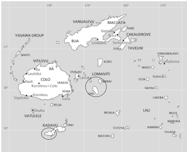
Figure 3: Map showing Fijian case study locations