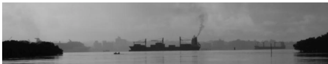
Figure 2: Container ship entering Suva Port

Prosecution of global-scale mitigation measures currently in train under IMO leadership, while promising to have a favourable impact on the global industry's emission profile, is likely to lead to increased costs and barriers in Oceania, whose contribution to the global emissions is so minute as to be irrelevant, resulting in a double penalty for no visible regional benefit (Nuttall, 2013). Pacific Islands cannot afford to lose much needed income in this way.