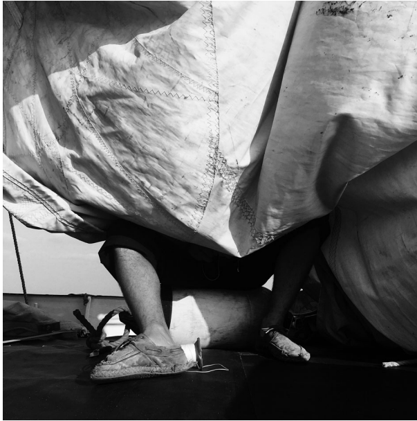
Figure 3. While anchored off the Belize coast over Easter, we spent our time mending sails and maintaining the ship.

since early January, as they lived on the ship while finalizing preparations for the voyage.