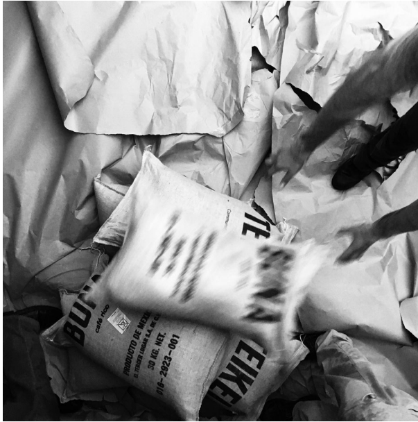
Figure 1. Loading a cargo of green coffee in Veracruz, Mexico.

The government of the Australian state of Victoria, where I live, argues that ‘staying apart keeps us together’ and many countries have urged their inhabitants to strictly observe ‘contact bubbles’ to reduce ‘community transmission’ of COVID-19. Our ship, like other cargo vessels, was a very closely-knit bubble of fifteen. Staying at sea was safe for us, and others. But it was also owing to the strict confinement of seafarers to their vessels, that countries have been able to maintain essential supplies since lockdowns started.